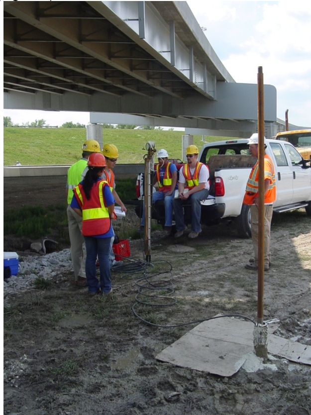
Figure 3. University faculty and graduate students performing pressuremeter tests at field test site in Kansas City, Missouri.

When characterizing shale materials, which are found across the state, laboratory tests are being performed in the field to reduce the potential for degradation of the rock that is common with such materials upon exposure (Figure 4).